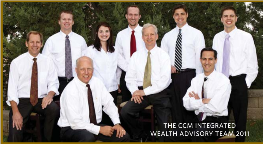
THE CCM INTEGRATED WEALTH ADVISORY TEAM 2011