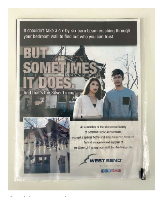
A polybag example.