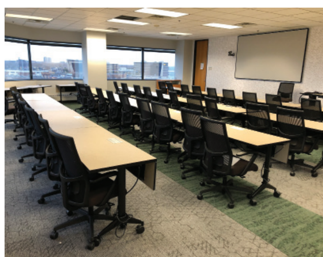
Meeting rooms accommodate boardroom or cluster setups for small teams and classroom setup for groups up to 75 people.