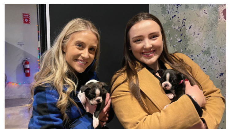
The Young Professionals Group enjoyed pints, puppies and CPA peers at this popular event.