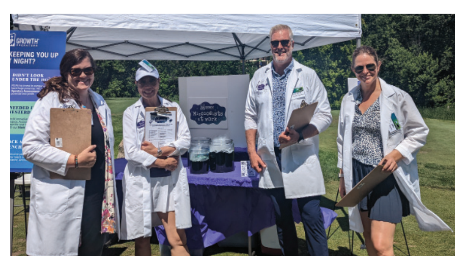
GROWTH Operators, a hole sponsor at a prior Golf Outing, were all smiles as they educated and entertained members all day long.