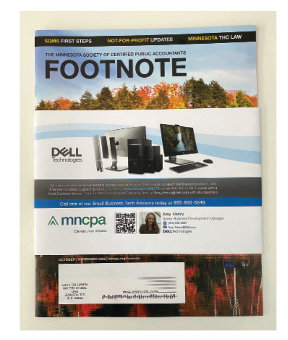
A bellyband example.

Learn more at www.mncpa.org/advertise/footnote.